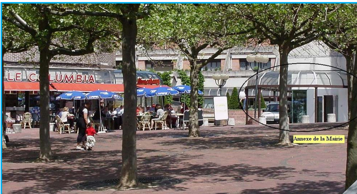
Mairie Annexe Cergy Préfecture

Tel: 01 34 33 45 65 - Fax : 01 30 30 45 88